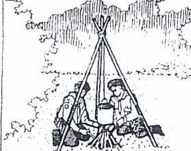
...as a cooking tripod