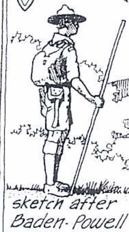
sketch after Baden-Powell