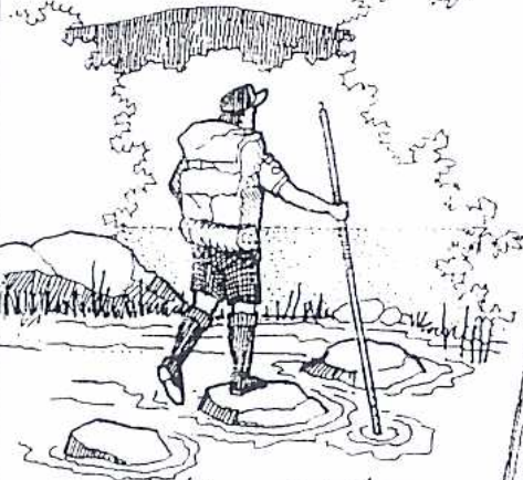
...as a hiking stabilizer